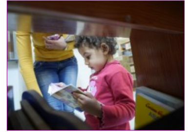
Student's child checking out a book

A new program this year, the ABTS Children's Library , was created initially to help the children of our theology students improve their English. Lebanese schools heavily emphasize English and the children of international theology students from Arab countries have been struggling to keep up with the more rigorous Lebanese curriculum. However, this library project has grown to include ABTS staff and faculty children, with 20-25 children coming each week. A growing collection of nearly 400 children's books have been sent to us from generous partners all around the world. A group of English and Arabic-speaking volunteers leads the program each Saturday, with different volunteers and parents reading books in English and Arabic during the story time, followed by a themed craft and the opportunity for each child to check out two books – to be returned the following week.