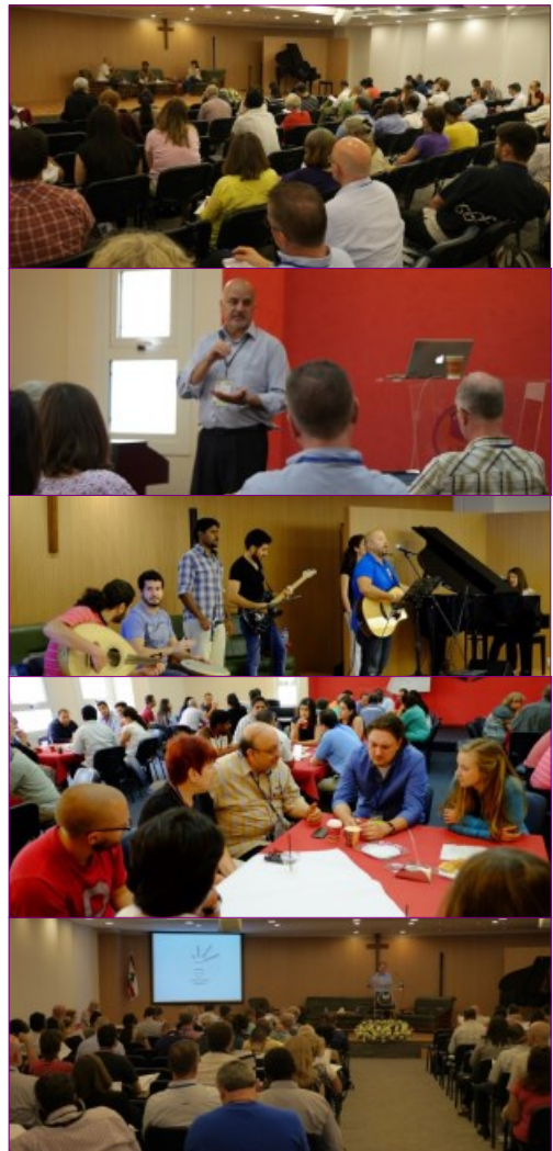
Photos of last year's consultation, June 2015

In this Issue | Middle East Consultation 2016, P1 | Student Affairs Seeking Holistic Student Formation, P3