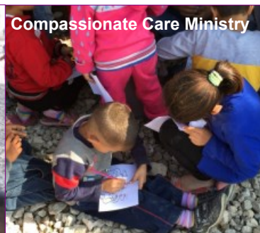
Compassionate Care Ministry