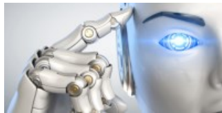
The AI Controversy?