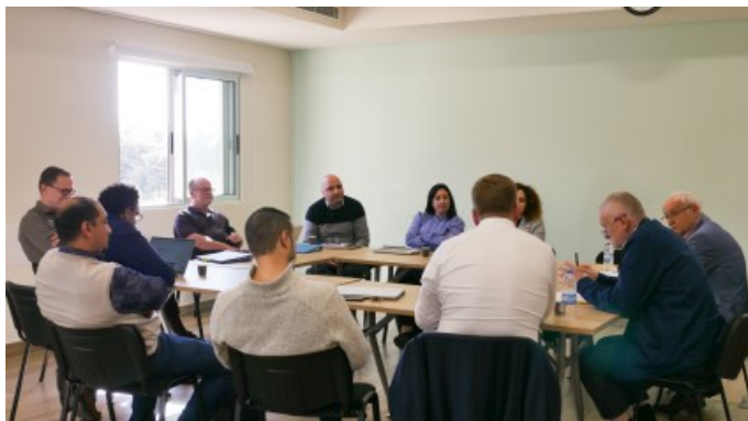
The Academic and the Accreditation Team Meeting