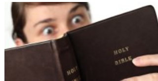
Towards a “Weak” Doctrine of Scripture: A Thought Experiment