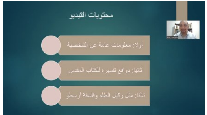
Elia During a Zoom Session

The impetus for the program emerged over time as we became increasingly aware of a need to make theological education more accessible to ministry team members and leaders of the Arab Church. The program was launched in February of 2015 with an initial cohort of 8 students and grew within its first cycle to provide theological learning opportunities to 21 students. Today, the program provides opportunities for theological education to more than 200 students a year. Since the program was launched, 62 students have graduated with a Certificate in Ministry. Students come from countries like Lebanon, Syria, Egypt, Algeria, Palestine, Jordan, Yemen, Iraq, Jordan, Morocco, Tunis, Sudan, South Sudan, and the diaspora, and are active in ministry in their local churches. The program is made up of formal courses and non-formal elements like spiritual and ministerial reflections and mentoring sessions that together provide a holistic learning experience for the student. While a student can complete the degree within a year and a half if they take all courses offered through the program, the degree is designed to be flexible, and students can take up to 6 years to complete the Certificate. This flexibility also allows students who are not looking for a complete degree to only take the courses that are most beneficial to their ministries and contexts.