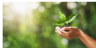
A Friendship That Never Stops Growing