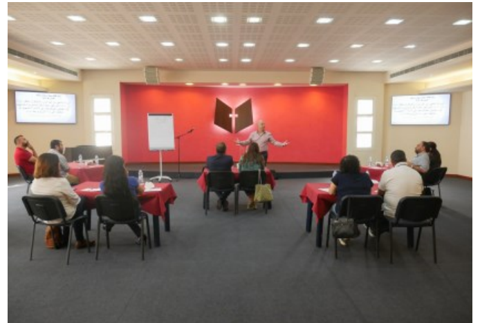
Peacemaking Training with Local Pastors —2020