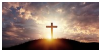
Revisiting the Goodness of the Good News