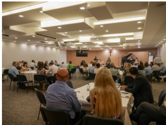
During a Peacemaking Event—2022

It has been a blessing to see so many different parts of the Lebanese Church come together in open cooperation to achieve a common goal. Lines of communication that before did not exist have opened up, and through them, we are finding ways to meet the needs arising in the Arab Church in a dynamic manner through our non-formal theological training workshops. And more and more, we are seeing a culture of reconciliation and peacemaking begin to form in the Lebanese Evangelical community. Most of all, I am proud of the pioneering work that the collaborative team of pastors took on through this project. Their initiative helped motivate others to join and be trained as peacemakers. It also helped us at ABTS as we continued to develop our approach to peacemaking so that we could share it with other churches serving in a shame and honor setting in the Arab world.